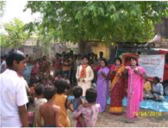
Folk song being used during the theatre show