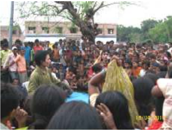
Quiz session after the show in Paschim Sekhpura