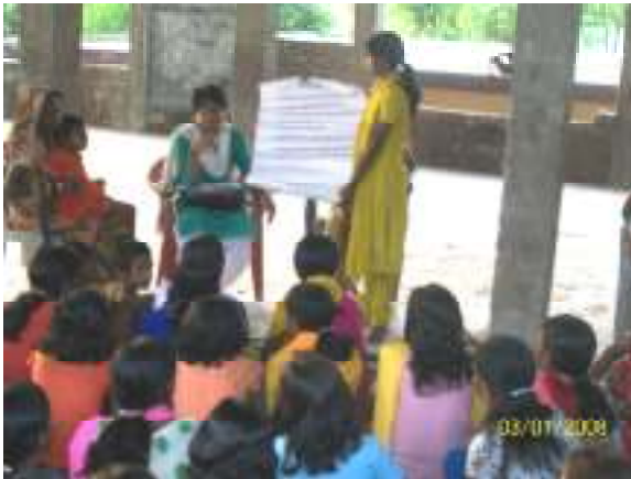
Workshop at Ramnagar village on 11.05.10