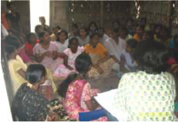
Workshop at Gopinathpur on 25.04.10