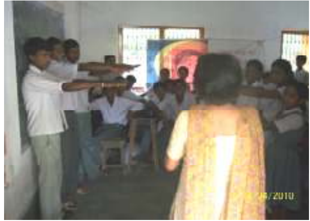
Alertness exercise during the workshop in Santabaidya High School on 28.04.10