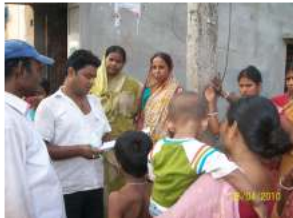
Feedback taking from audience after show in Jodupur II GP