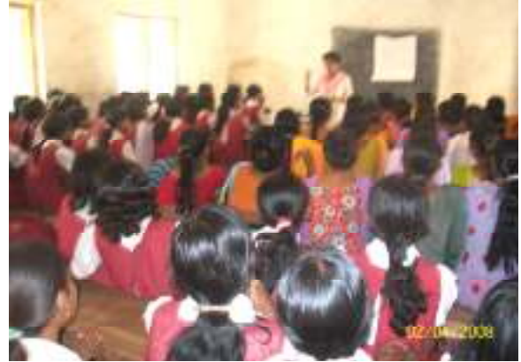
Workshop with students of Dharampur MSK on 10.05.10