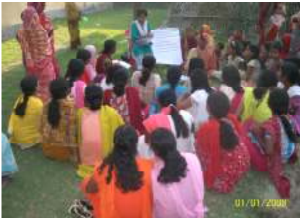
Workshop in Moslempur on 09.05.10