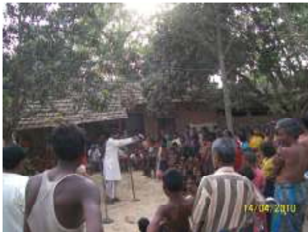
Quiz session after the show in Narhatta