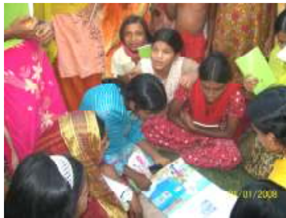
Girls discussing their action plan with the flip chart during workshop in Lalbathani on 30.04.10