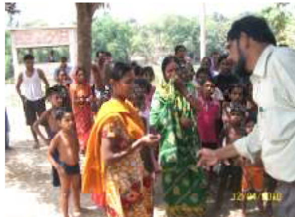
Token gift given to the correct respondent in quiz session