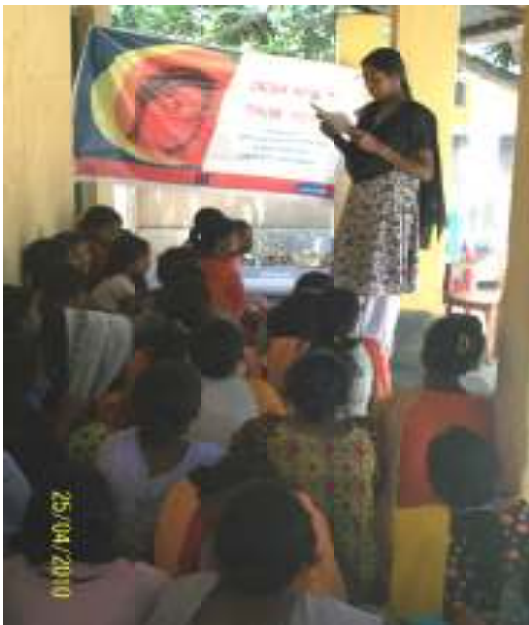
Case study reading by a girl at workshop in Parbatta on 25.04.10