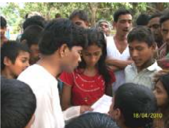
Feedback taking from girls & boys in post show session in Dharampur