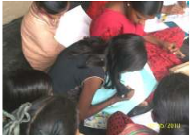
Participants writing their suggestions in Sudhalyapur on 02.05.10