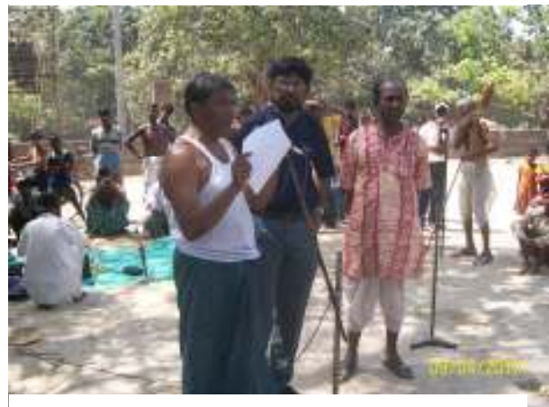
Member of Gram Unnayan Samity addressing the issue of trafficking at post show session in Barampur