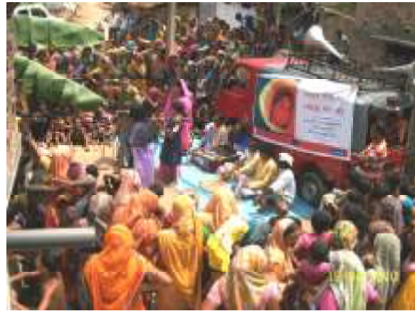
Villagers watching the show in Dharampur