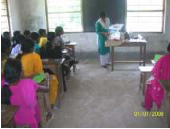
Workshop with girls in Kalindri on 09.05.10