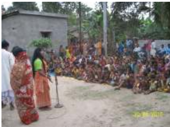
GP members, CBO and SHG members watching show in Sudhalyapur village