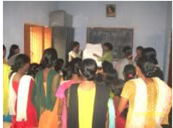
Workshop at Paschim Sekhpura on 03.05.10