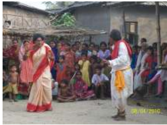
Theatre show in Phulberia GP