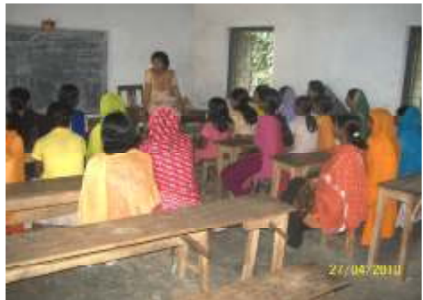
Workshop in Babupur on 27.04.10