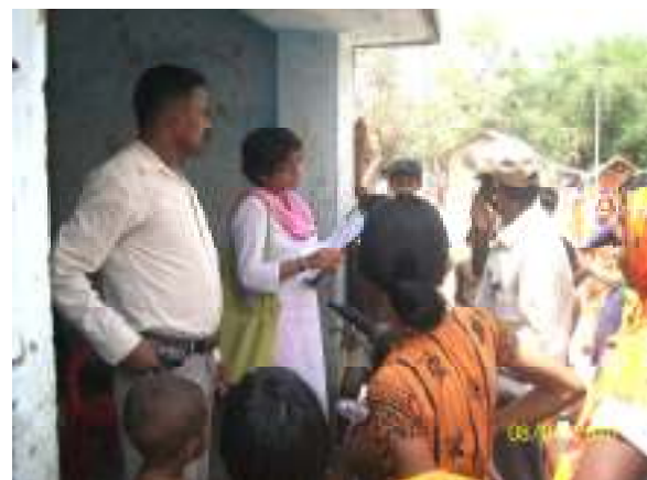
Problem sharing with teachers & club members in Enayetpur