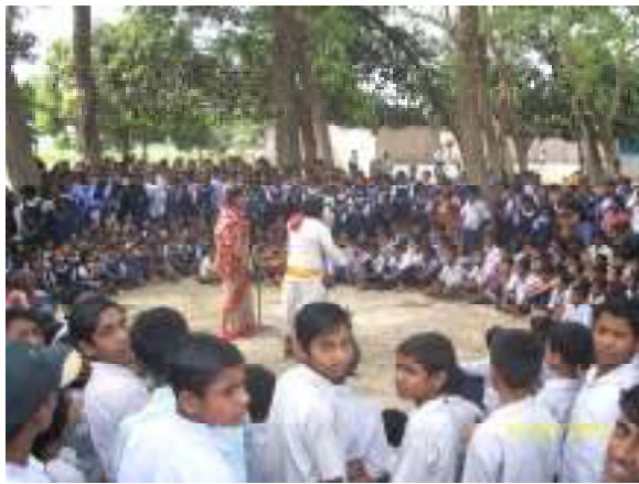
Awareness campaign in Kazigram High School