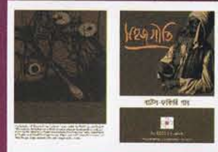
Sahajgeeti - A collection of Baul songs

The minstrels are using laptops, recording songs in studios and participating in video productions which are being showcased in YouTube. Songs passed down orally through generation after generation have been compiled into an invaluable collection of 740 Baul songs - Sahajgeeti . Audio CD - Gaiche Baul Gaiche Fakir - first time recording of these rural singers has been highly acclaimed.