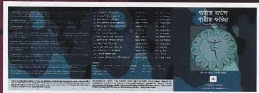
Gaiche Baul Gaiche Fakir -An audio CD

Enliven your next programme – at school, college, office, club or in your locality with a Baul or Fakiri song. Make your campaign more powerful by using folk media to motivate and mobilize change. Simply listen to their song or watch their video in a quiet moment. Cherish their philosophy of love and simplicity.