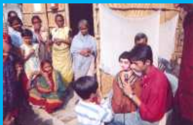
Culture & Health