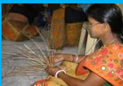
Culture & Livelihood

banglanatak dot com is a social enterprise working at grass roots across India since 2000. The organization works with the following objectives (a) fostering pro-poor growth; (b) protecting rights of women, children and indigenous people and (c) promoting culture for employment, inclusion and growth.