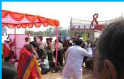
Culture & HIV/AIDS