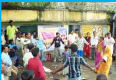
Culture & Human Rights