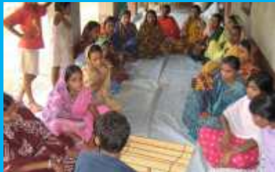
Culture & Development